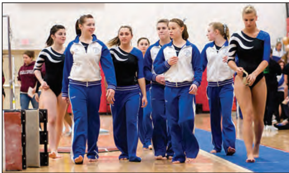
Above, the team marches together toward their first challenge of the day.